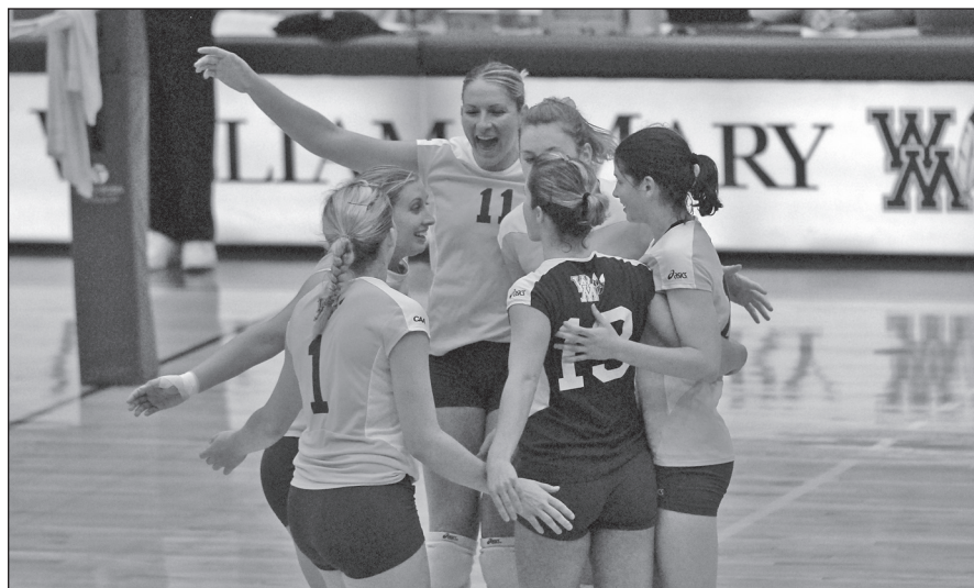
The talented 2007 Tribe squad should provide plenty of excitement.