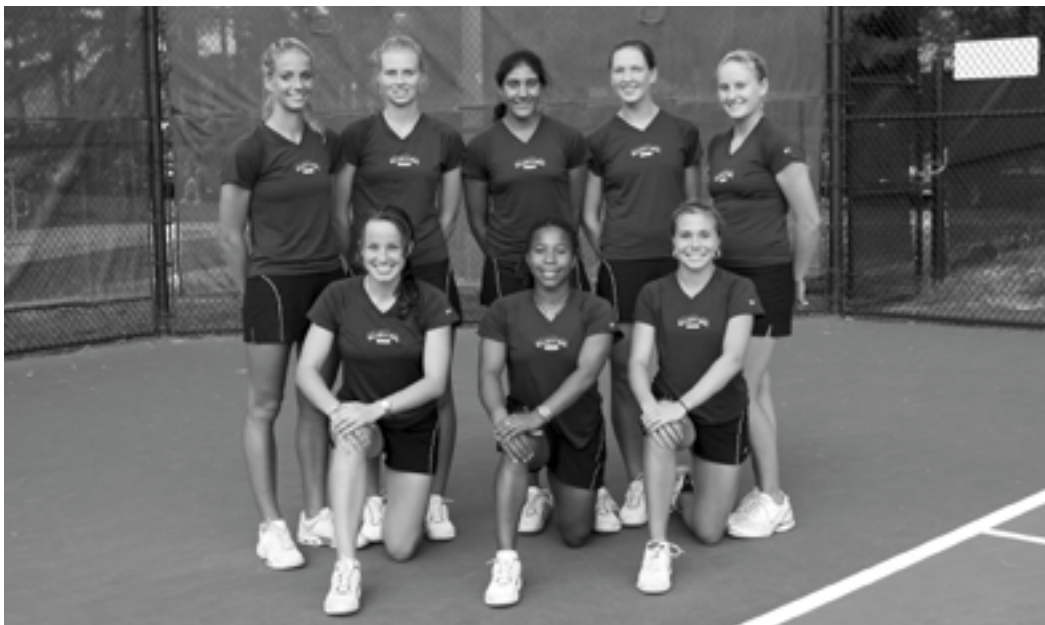
2007-08 WILLIAM AND MARY WOMEN'S TENNIS TEAM