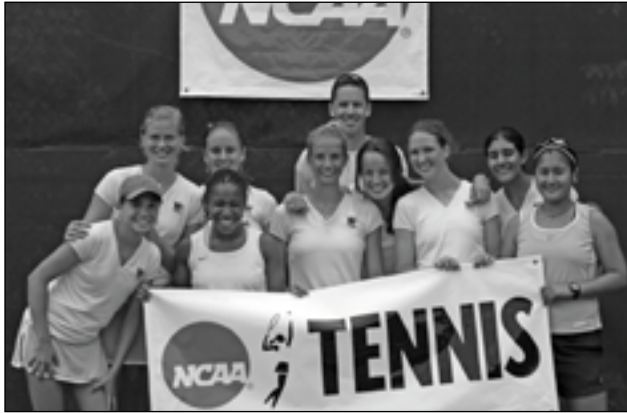
The Tribe advanced to the NCAA Round of 16 in 2007 after winning a pair of regional matches in Williamsburg as the No. 15 seed.

William and Mary's rise to national prominence is due, at least in part, to the team's success at the NCAA Championships. In 12 of the last 13 seasons and 16 overall, the Tribe has competed in the NCAA Championships as a team, while also sending numerous individuals to the NCAA Championships in singles and doubles. Although the College had previously placed athletes in the NCAA Tournament as individuals or doubles teams, William and Mary first reached the NCAAs as a team in 1989. In the spring of 1992 the Tribe achieved its first victory at the NCAA Tournament, defeating 15th-ranked Miami in the first round.