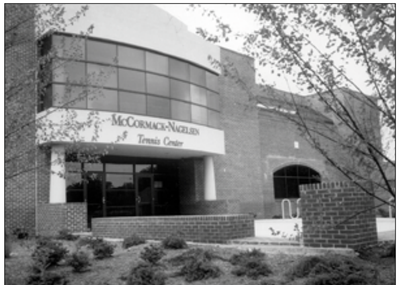
Mark McCormack provided the funding for the McCormack-Nagelsen Tennis Center, one of the finest indoor college tennis facilities in the nation.