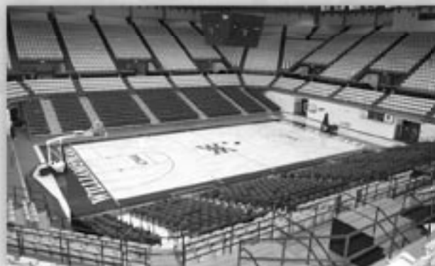
Kaplan Arena at William and Mary Hall