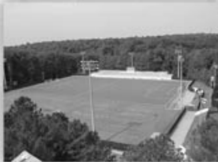
Busch Turf Field