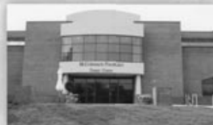
McCormack-Nagelsen Tennis Center