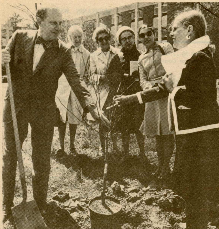
The Williamsburg chapter of the Daughters of the American Revolution recently presented the College four dogwood trees as part of the 13 to be planted by 1976 to commemorate the 13 original colonies.