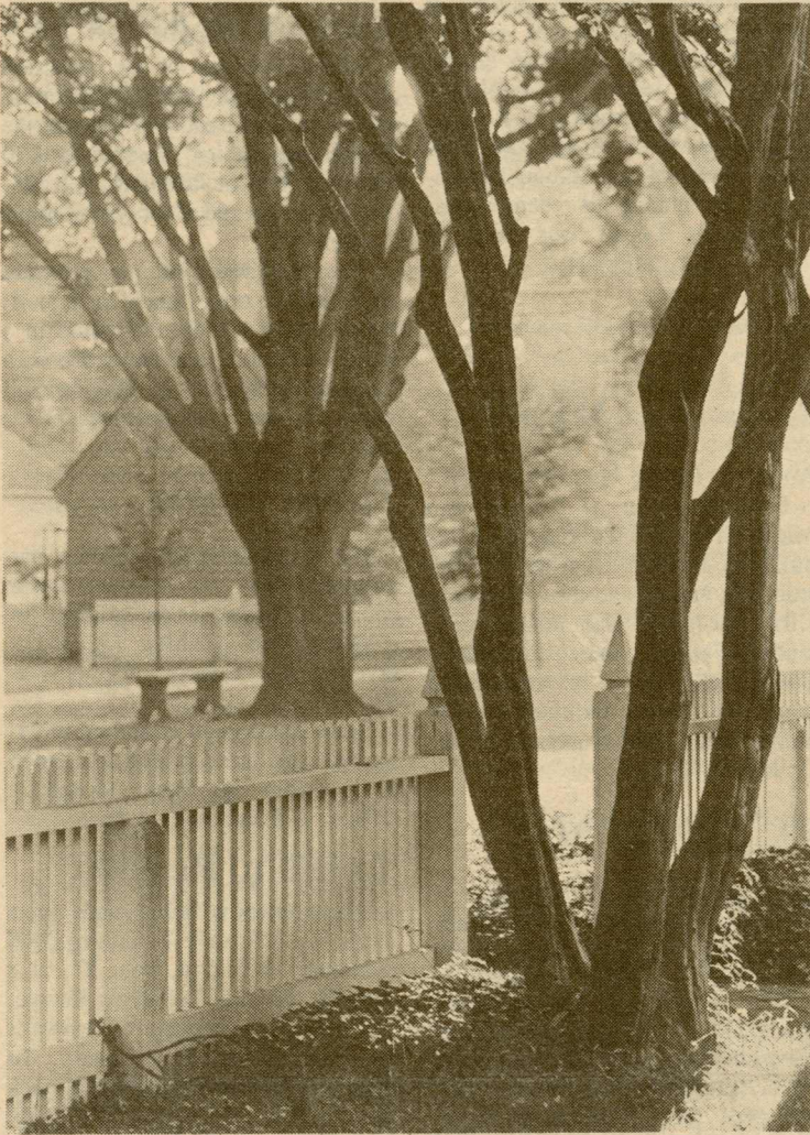
The mist begins to lift in this early morning scene on campus. The view is from the Wren Building looking toward the President's House guest cottage.