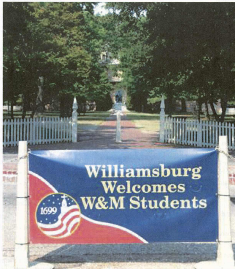
The City of Williamsburg started a new tradition this year, posting eight signs around town welcoming William and Mary's students back to school. The signs were posted at locations surrounding the campus and at the city's entrance corridors.

William and Mary's graduate and professional schools saw similar success in recruiting this year's class. For example, the William and Mary Law School received a record number of applications—nearly 4,600 applicants for an entering class of 220. The Law School's newest class includes students who graduated from 122 colleges and universities across the country and recorded a median LSAT score in the 90th percentile.