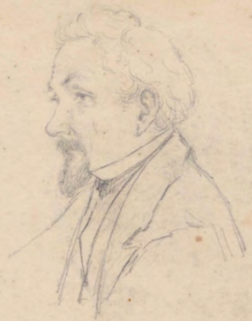
R. de Beaumont