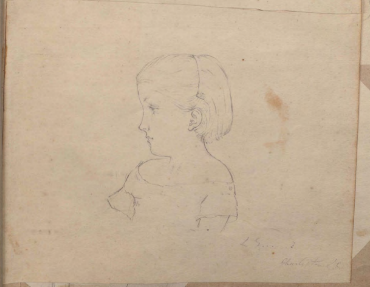
25. ... Charlotte, N.C.