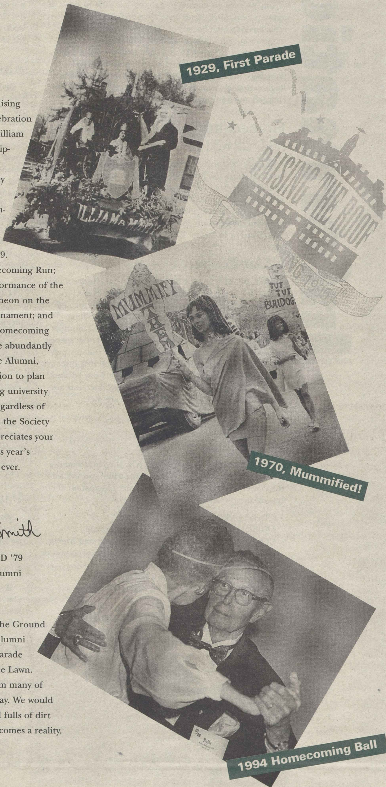
1929, First Parade

This is a special invitation to attend the Ground Breaking for the William and Mary Alumni Center following the Homecoming Parade and just prior to the Luncheon on the Lawn. Thanks to assistance and support from many of you, this project will soon be underway. We would like you to be there as the first shovel fulls of dirt are turned and "Raising the Roof" becomes a reality.