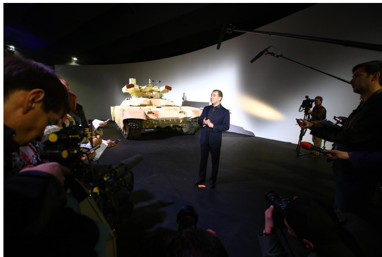
Dimitry Medvedev speaking at the expo

There are also political reasons for Putin to pour more money into the military. Putin has made many remarks about Russia's need to defend itself. By creating an atmosphere of fear and portraying himself as standing up to America and the West, Putin hopes to gain popularity. This tactic goes hand in hand with the Kremlin's frequent accusations of opposition leaders being