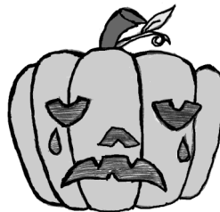
Russian literature Jack-o'-Lantern