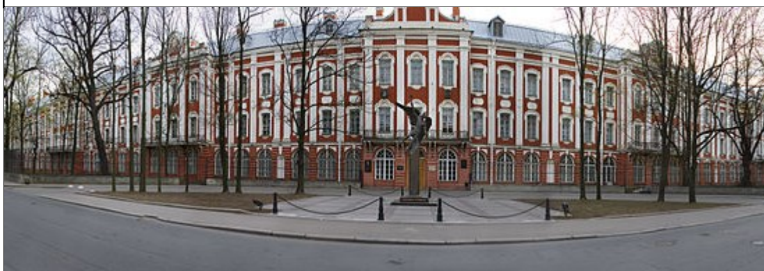
The Twelve Collegia of St. Petersburg University