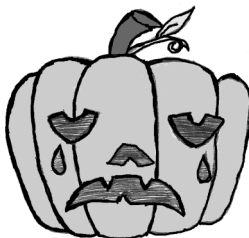
Светильник Джека из Русской литературы