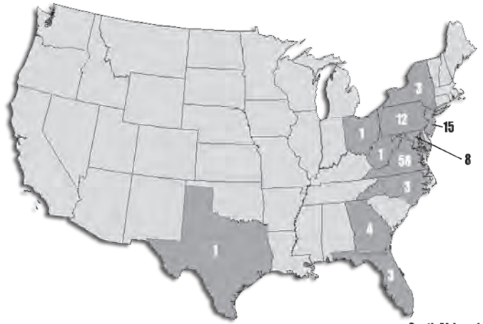
South Africa - 1