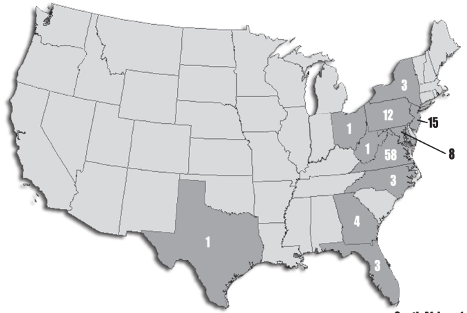
South Africa - 1