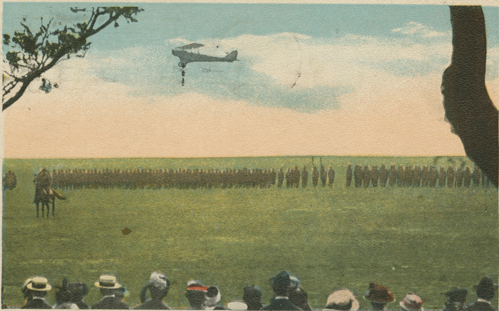
U. S. AEROPLANE DIRECTING TROOPS' FIELD MANEUVERS.

PRINTED BY CENSOR, WASHINGTON, D. C.