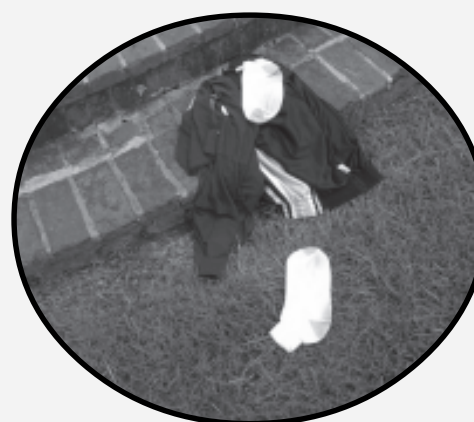
Streak the Sunken Gardens