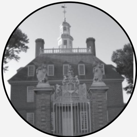
Jump the wall at the Governor's Palace