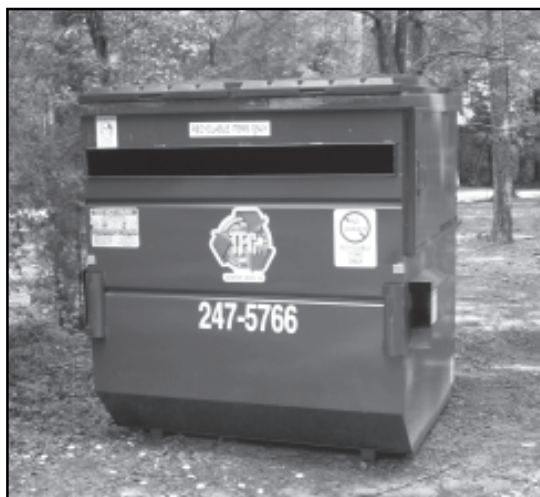
Reduce, reuse: Recycling on campus will not only improve environment but it will also save school money.

With the many new developments in the Student Assembly, many freshman and maybe some upperclassmen may be wondering how they can become involved with their student government. One great way to get involved is through elected office. This year's freshman elections are being held on September 15. If running for office isn't your thing then the class councils, especially First Year Council, are highly recommended. First Year Council is an independent agency that helps the newly elected freshman class officers run the many events and fundraisers throughout freshman year. For more information on this and any other student government topic please go to: http://sa.wm.edu .