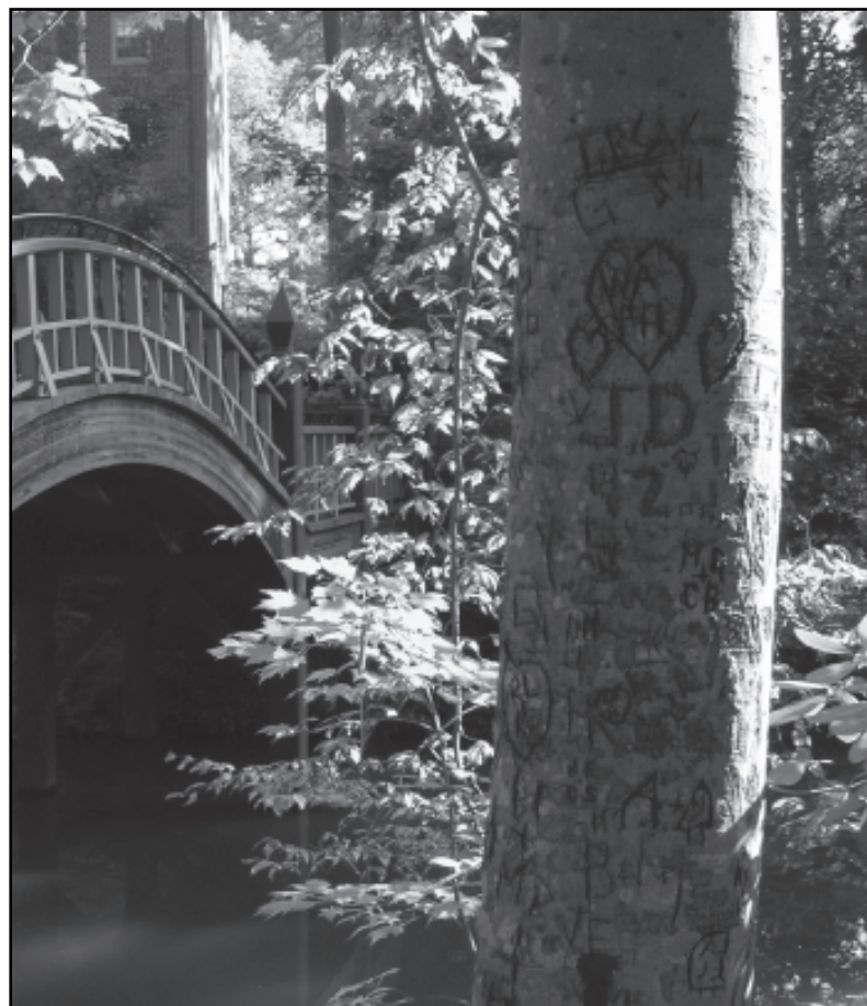
Lovers' mark on campus: A tree by the Crim Dell is etched with romance.