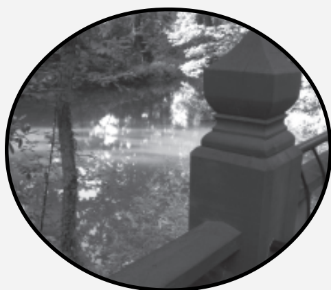
Swim in the Crim Dell