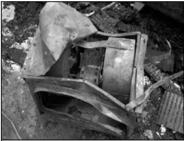
(Above) The culprit: Exhaust fan in the attic of Preston Hall which caused the May 3, 2005 fire. (Right) The fire's aftermath: Many rooms on the third floor were destroyed. Note the students' belongings among the wreckage.