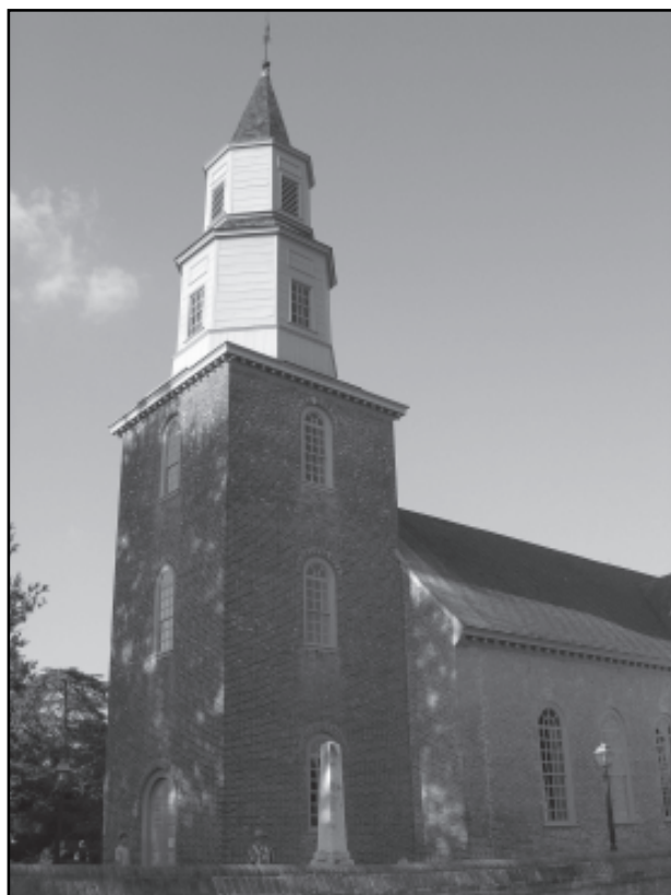
Bruton Parish: in addition to a historic place of worship, Bruton Parish is a quaint fixture along DoG Street which also features choral concerts and recitals throughout the year.

Bruton Parish Church 331 Duke of Gloucester Street College Service: 5:30 pm Sunday Holy Eucharist: 5 pm Tuesday (Wren Chapel, Old Campus) (229-2891) www.brutonparish.org